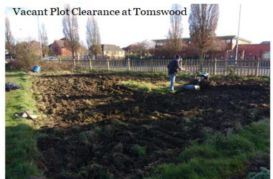
Vacant Plot Clearance at Tomswood

Other areas can be cleared later, so if you can spare some time please get in touch with the committee either by email or in person. Or ... leave a note in the post box on the gate by the shop.