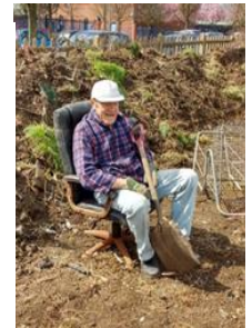
2016 Winning Photo

Bountiful Earth Wildlife at the Allotment Allotment Structures